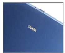
Cool metallic blue