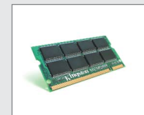
Kingston™ RAM memory expansion