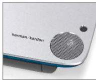
Harman Kardon speakers