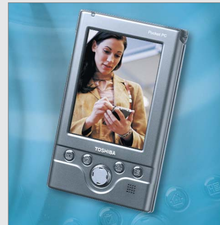
Pocket PC e350

Just some of the optional Toshiba accessories available to complete your mobile solution