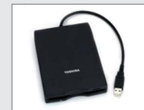
USB Floppy disk drive