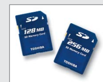
SD memory cards (Sat A20 & P20 only)