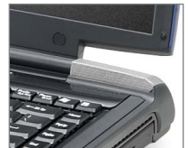
Harman Kardon speakers