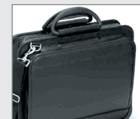
Slimline Koskin Carry Bag