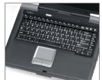
Designed for expandability